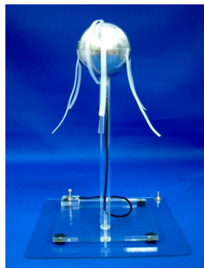
Photo 1. Aluminum Collecting Sphere with Paper Strips Attached