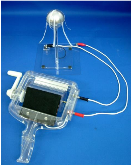
Photo 2. Connection with the Electrostatic Generator

the sphere in the photographs. Experiments yield the same results if you reverse the polarity.